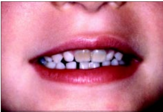
Fig 4. Darkened maxillary primary central incisors are a distraction to the smile

Treatment options were discussed, including no treatment, composite veneers or a pulpectomy with composite crowns. However, none of those treatments would necessarily improve the color without some sacrifice of overall esthetics or unnecessary treatment. With the consent of the parents, one of whom was an oral surgeon, the decision was made to attempt vital bleaching with 10% carbamide peroxide in a custom-fitted tray as had been reported successful for adult teeth darkened by trauma. 5