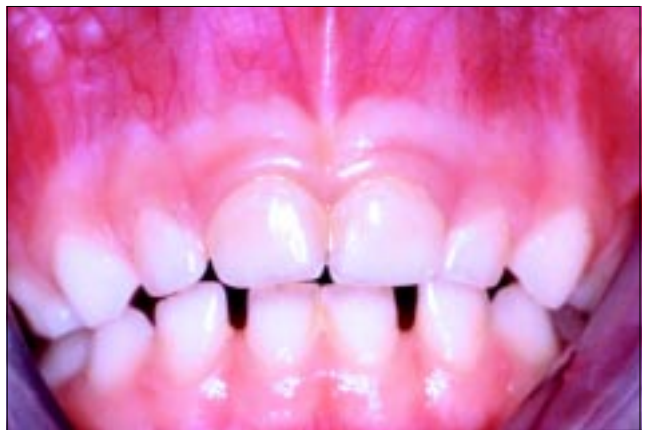
Fig 5. Maxillary primary central incisors are lightened somewhat by bleaching with 10% carbamide peroxide in a custom-fitted tray for 47 total hours

With primary teeth, there is always the concern for the effect of the trauma on the formation of the permanent teeth. However, there does not seem to be any indication that this low concentration of 10% carbamide peroxide will affect the tooth whether it is vital or non-vital, nor that it would cause a non-vital tooth to become symptomatic. Normal recall schedules for traumatized teeth should be followed whether bleaching is attempted or not.