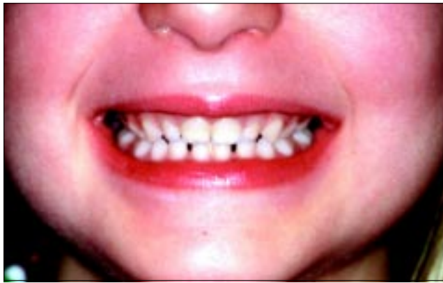
Fig 6. The four-year old child's smile is more esthetically pleasing with lightened teeth

With any treatment of children, concern should always be for dosage of material. The use of a non-scalloped tray design minimized the amount of material used. It has been found that only a minimum material is required for bleaching, 10 more like applying Vaseline to the teeth in a "thin-film" technology approach. The use of a non-scalloped tray also served to contain the material better, since this type of tray "seals" against the gingivae. However, there is little concern of ingestion for the minimal amount of material used during this treatment, since this 10% carbamide peroxide material has been used in newborn infants for throat infections. 11 In that report, 10 drops of a 10% carbamide peroxide were applied in 25 newborn infants after each feeding for 2 to 7 days to reduce the treatment time with no problems. This treatment is a standard protocol at pediatric hospitals today. Other uses, including use for three years as a mouth rinse in orthodontic patients to prevent white spot lesions, have demonstrated safety in young children. 12