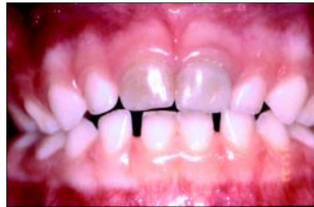
Fig 2. Maxillary primary central incisors have been darkened following trauma

Received July 3, 2001 Revision Accepted November 15, 2001